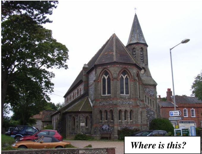
Where is this?