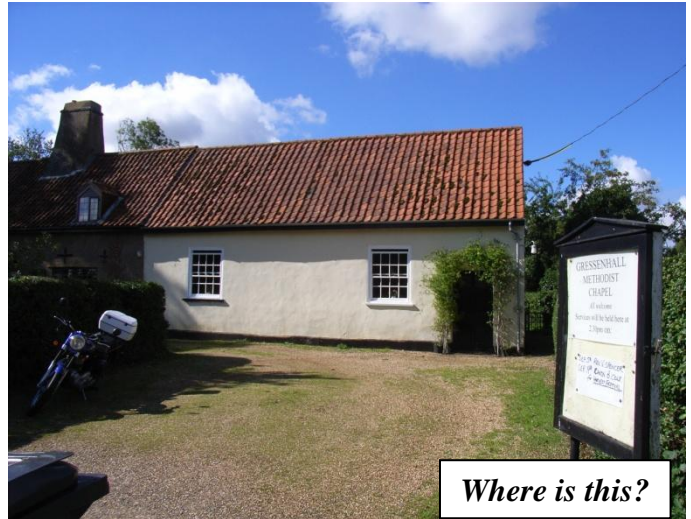
Where is this?